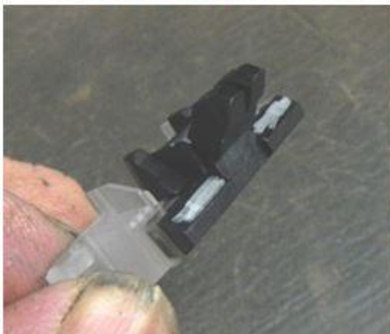
The larger blade drive can rub against the hinge and make noise. I've painted the part of the drive that moves real close to the hinge

A temporary fix you can do yourself with the new Andis blade drive